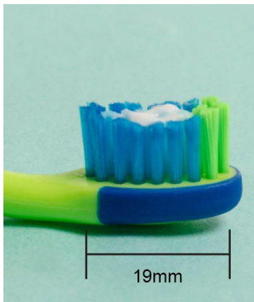
smear for 0 – 3 year olds